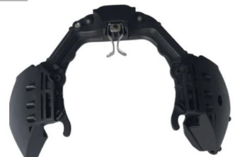
Full face mask DSM-1