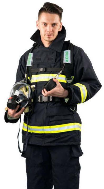
Article number: 01016

DSBA6.8/A uses state-of-the-art harness materials designed to withstand the high wear and tear that operation personnel face every day. The product is equipped with a durable stainless steel lock and a long-life aramid blending belt, making it ideal for long wear and frequent use.