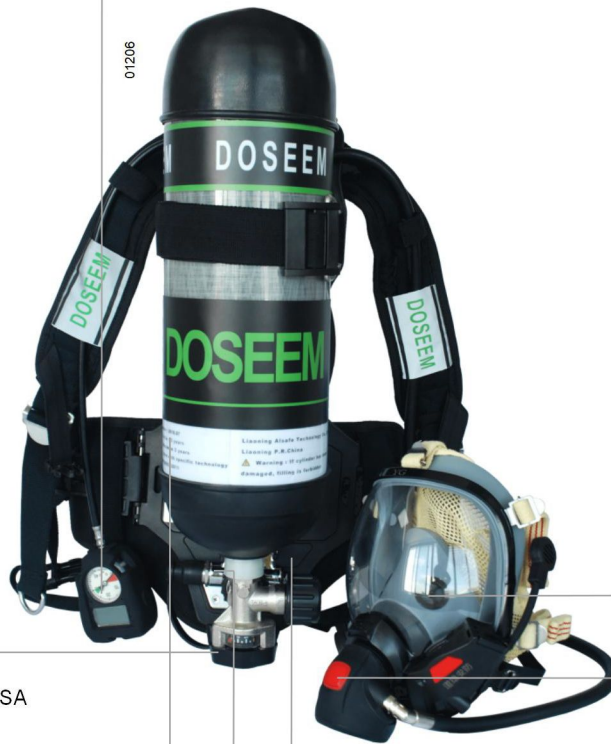
Pressure gauge cylinder valve KHF-30SA