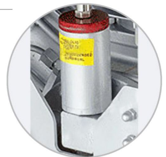
Oil Filling Barrel