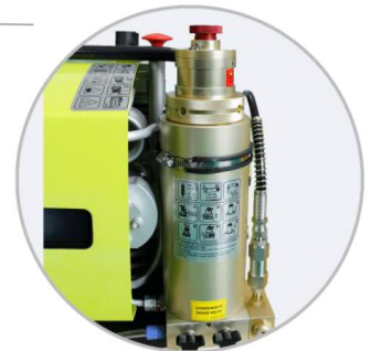
Active Carbon Molecular Sieve Filter