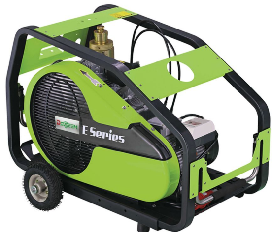
Article number: 06010